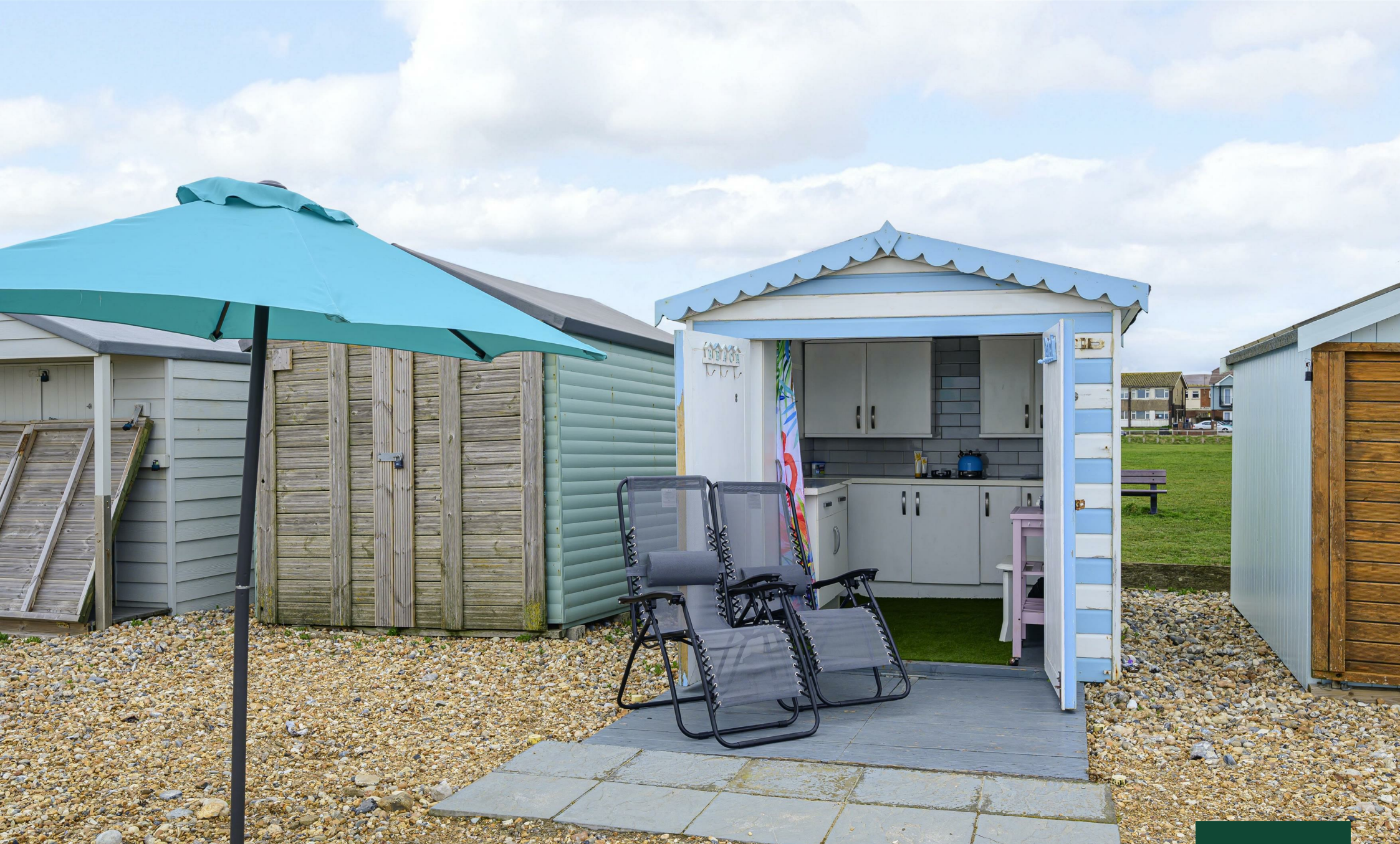
Beach Hut 76b Beach Green, Brighton Road | | Lancing LN14 5DA